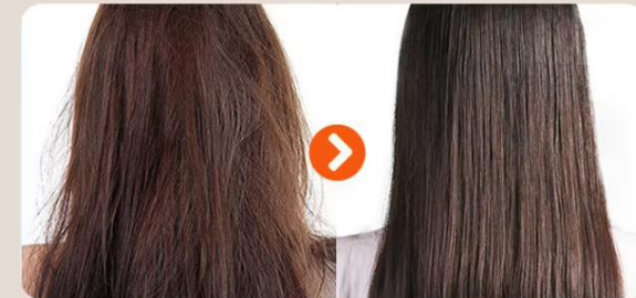
Straight hair style