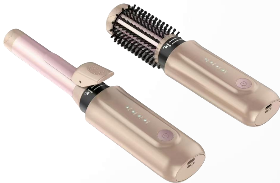
GT-2308 Curling Iron & 2-in-1 Styling Comb